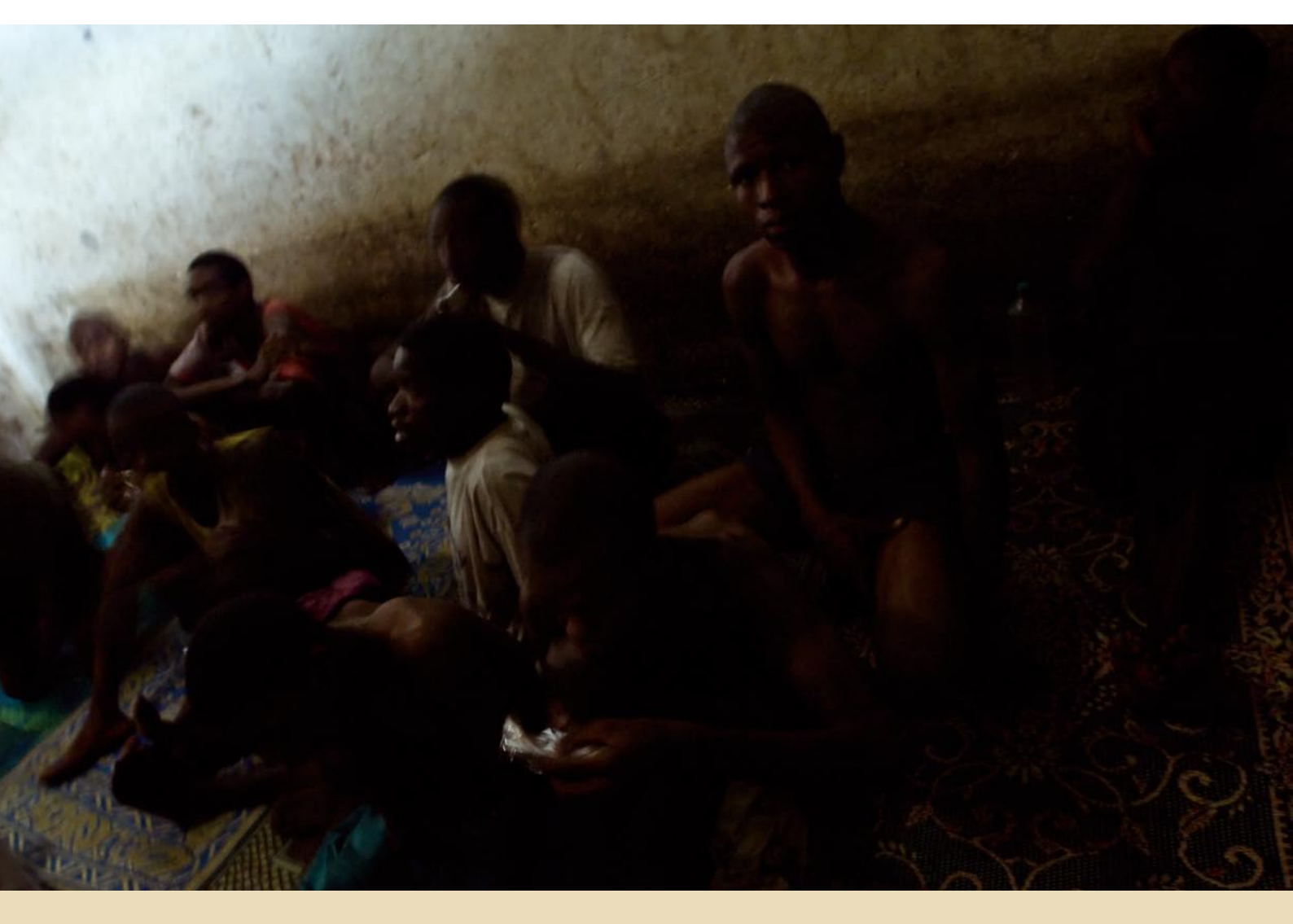
Around 25 inmates are crammed in this dark and poorly ventilated cell