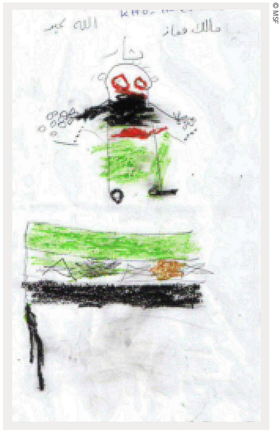
Syrian children's drawings in Kilis

Children are also at risk of being caught in the bombardment if they go out of the house. When there are heavy periods of bombardment they are forced to stay indoors and get very little chance to play outside, something that is an important activity for the healthy development of children.