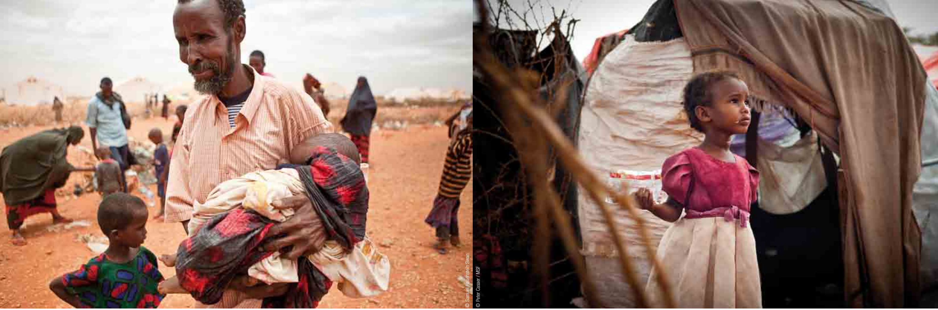
All new arrivals are screened for disease and malnutrition at the Dolo Ado border crossing from Somalia into Ethiopia.