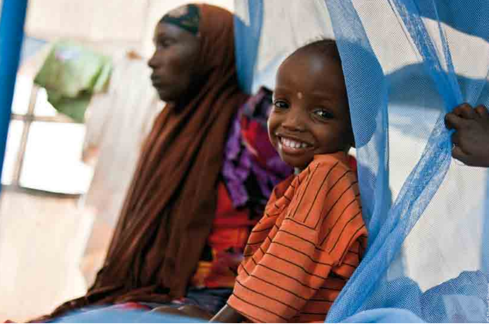
A mother and her 3-year-old son have been in the therapeutic feeding centre of Dolo Health Center for 17 days because the child was severely malnourished. "We are from Gedo, and for the last ten years, we have had to flee to Ethiopia regularly because of war or drought.".