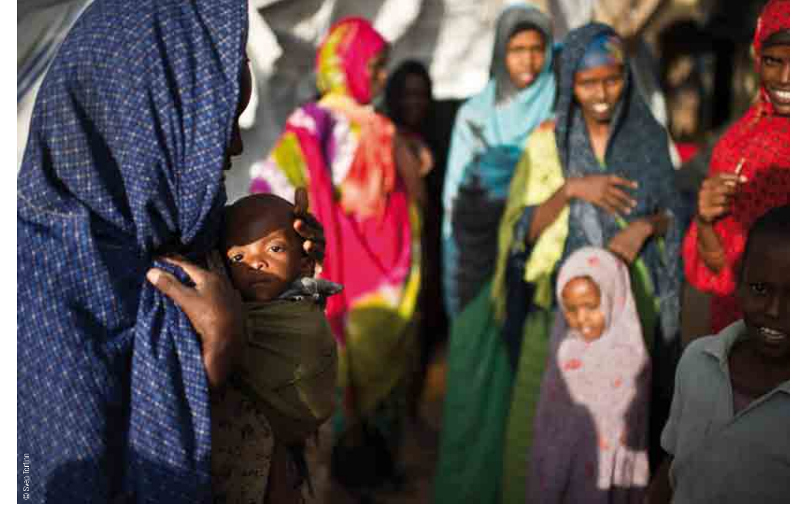
Women waiting in front of the therapeutic feeding centre at the hospital MSF runs in Galcayo South, Somalia.

There is violence, poverty and mismanagement in my town. My sons refused to join the fighting so one was wounded, the other killed. I was threatened and I had to flee. I escaped at night and travelled by foot for more than 30 days. There was no food so I had to eat tree leaves. I was arrested and interrogated before I could continue to Ethiopia. I will not go back home until there is peace. Man, 40, from Lower Juba