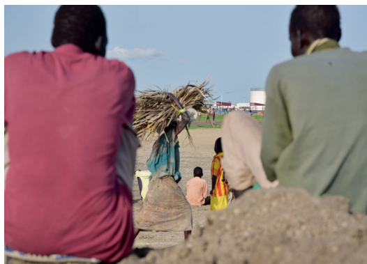
Two men look on as a woman returns to the site after collecting firewood

Since February 2016, MSF has provided 406 consultations for physical injuries associated with violence