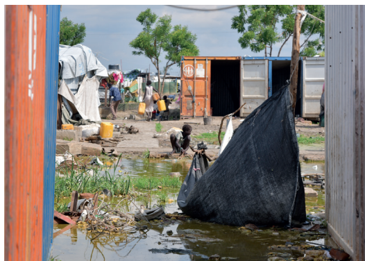
Arijun Claire © MSF